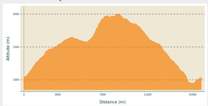
Min elevation 946 m Max elevation 2000 m

From the car park, go up into the village past the Auberge de l'Eau Rousse, then turn left over the last houses of the hamlet and take the path. At the flat, after the house in the meadow, stay on the path on the right.