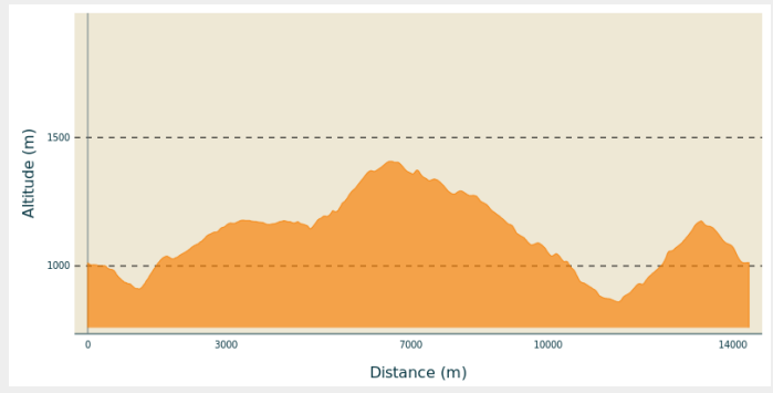
Min elevation 860 m Max elevation 1407 m

Starting at Molençon (1600m), take the path of the Grand Tour of Tarentaise, on the right hand side after the hamlet, until arriving at La Cudraz (1030m). Continue on the right, through the forest to reach the Ronchat village (1176m) offering a view of the Morel Valley. Find the road and walk along until you breach the 'Grant Nant de Nâves' bridge, after which the path takes a left turn into the woods which holds the ruins of an ancient windmill.