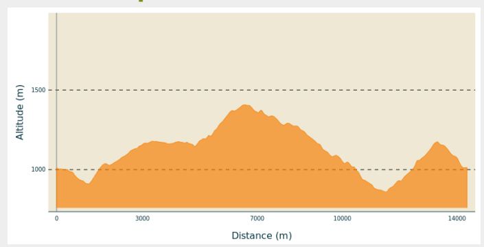
Min elevation 860 m Max elevation 1407 m

Starting at Molençon (1600m), take the path of the Grand Tour of Tarentaise, on the right hand side after the hamlet, until arriving at La Cudraz (1030m). Continue on the right, through the forest to reach the Ronchat village (1176m) offering a view of the Morel Valley. Find the road and walk along until you breach the 'Grant Nant de Nâves' bridge, after which the path takes a left turn into the woods which holds the ruins of an ancient windmill.