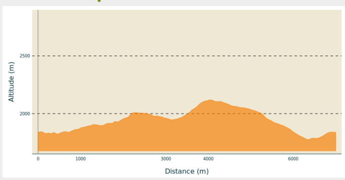
Min elevation 1775 m Max elevation 2119 m

The starting point is at the Refuge du logis des fées (1830m). Follow the road uphill to the point where the forest gives way to the high altitude grassland.