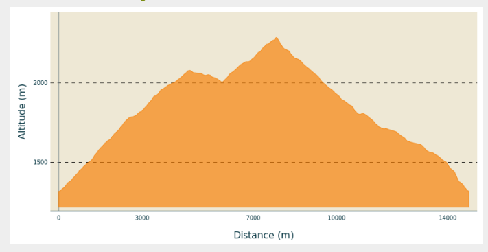
Min elevation 1318 m Max elevation 2284 m

After the Grand-Nâves bridge, take a left turn. The trail begins 100m further on.