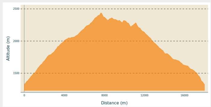
Min elevation 1328 m Max elevation 2438 m

After the Grand-Nâves bridge, take a left turn. The trail begins 100m further on.