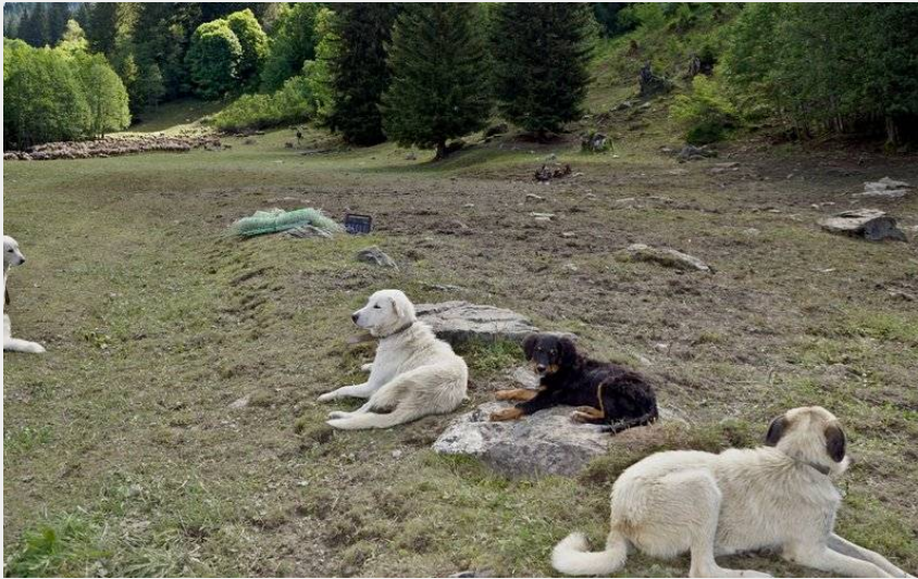
Chiens de berger (ccva)