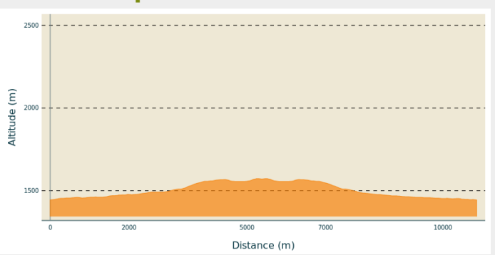
Min elevation 1444 m Max elevation 1573 m

The itinerary starts at the entrance to Champagny le Haut Valley, making its way along the left bank on a forest trail before switching to the right bank when you leave the hamlet of La Chiserette, taking you through the hamlets of Le Bois and Friburge, and then, by road, to the hamlet of Laisonnay. After taking full advantage of the tranquillity and beauty of the surroundings, you continue on along the road for a few hundred metres to rejoin a trail inFriburge, which will take you to the hamlet of Le Bois, and then, again by road, to La Chiserette before returning to your point of departure.