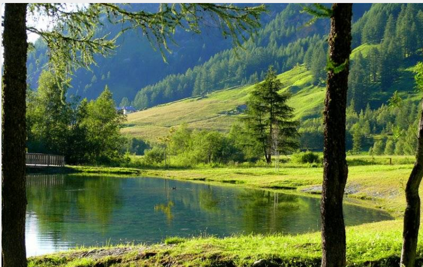
Gouille de Rosuel (APTV)