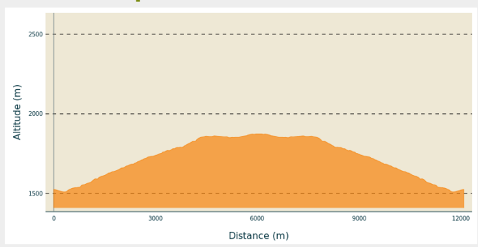
Min elevation 1510 m Max elevation 1874 m

Running from the resort of Sainte Foy Tarentaise to the famous village of Le Monal, this route is easygoing and follows a very good track. Do brace yourselves, though, for an energetic start over the first 30 metres! And note that there may well be lots of walkers out too, so control your speed and let them know you're coming.