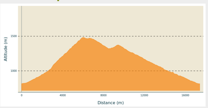
Min elevation 814 m Max elevation 1484 m

Setting off from Bourg-Saint-Maurice, this route takes you past old Alpine defence buildings. The first stretch runs along roads as far as the hamlet of Le Villaret along a lovely uphill section. After the hamlet, a steep and slightly more technical track leads up to the highest point of this outing: the hamlet of Grandville, at 1,484m. The descent takes you all the way back down to the centre of Bourg-Saint-Maurice, along a quiet mountain road, with a stunning view over the Beaufortin and La Vanoise mountain ranges to accompany you!