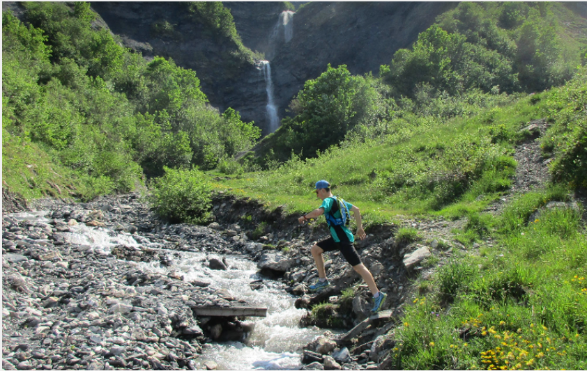
Devant la cascade du Morel (CCVA)