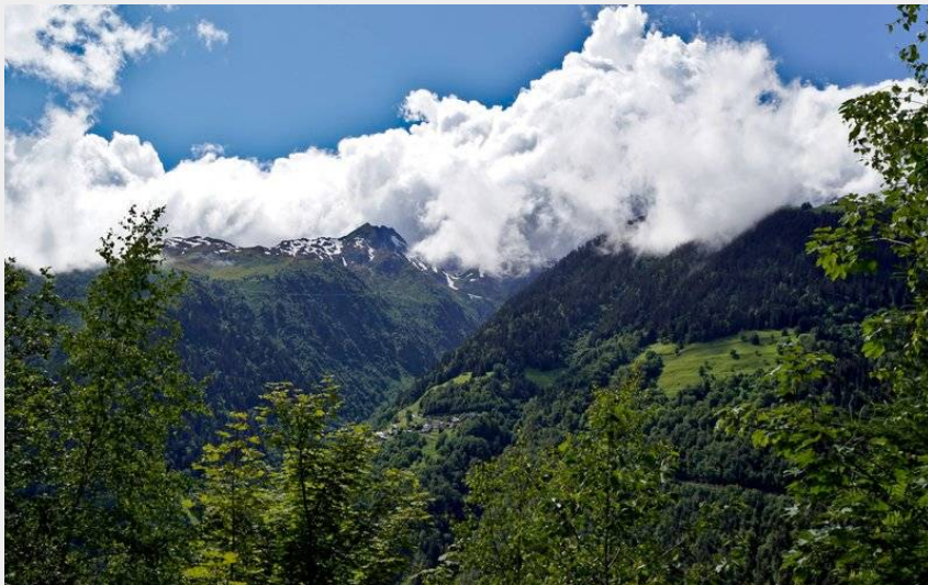
Vue sur la pointe des Marmottes Noires (ccva)