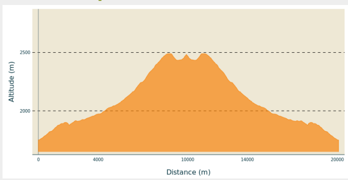
Min elevation 1749 m Max elevation 2490 m