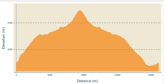
Min elevation 1692 m Max elevation 2738 m

From the chapel of Sainte-Marie-Madeleine, the trail (in the direction of the Refuge de Vallonbrun) rises in to a sparse forest of conifers and bypasses rocky outcrops. A welldeveloped ericaceous moor covers the slopes. The trees gradually disappear and give way to the pastures. Pass through the ruined barns of Mollard. Then make a sharp left turn (leave the path leading to Châtelard on your right). The path then leads to the chapel of Saint-Antoine, clearly visible on its promontory (approximately 2,300 m in altitude). Nearby, the chalets of La Fesse d'en haut mark the upstream Vallonbrun valley. Go down to the refuge by the track. Below the refuge, turn right (GR®5) in the direction of Pierre aux Pieds: entrance to the heart of the National Park. The trail, which is initially wide up to the chalets of La Fesse du Milieu then runs along the slope gently climbing and crossing several streams. Before the Plan de la Cha, take a wide path on the right (old track created for works). Start of the section of the route outside the GR®5. Reach a small pass (approximately 2400 m in altitude) where the horizon emerges. Continue north (slight descent), and pass the Diet stream (no footbridge). A rising crossing lets you gain a foothold on the plateau of Marmottières. The winding path then crosses a steep area of approximately 200 m in ascent. The relief eases. Continue for 300 m to reach the destination of the hike: the engraved erratic block of the Pierre aux Pieds.