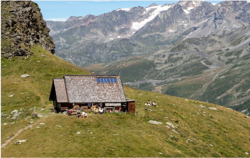
Le refuge de Turia (GOTTI Christophe)