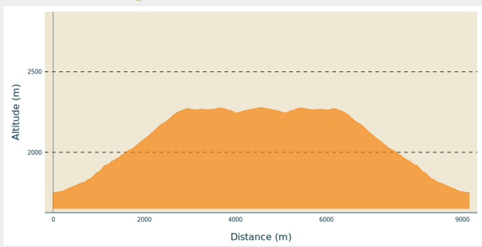
Min elevation 1749 m Max elevation 2277 m